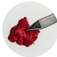
Moldable upon rehydration