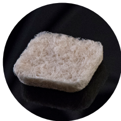
100% bone fibers