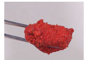
Simulated autograft mixed with PliaFX Prime